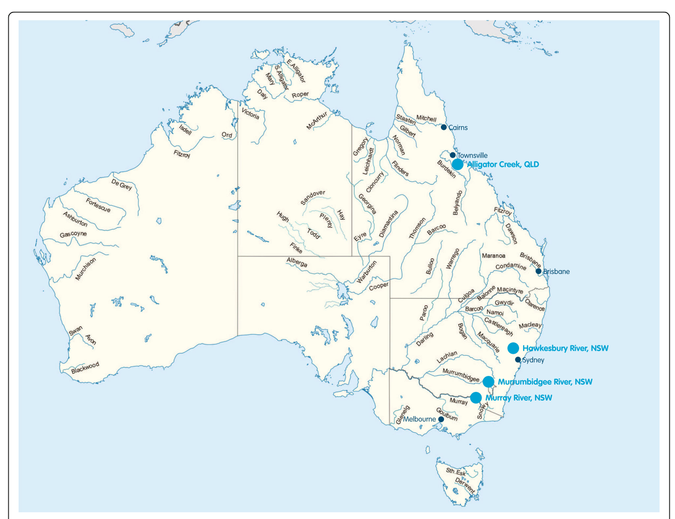
Fig. 1 Map of Australia depicting the four pilot research sites. Please note: This figure has been adapted from the original map 'Major rivers of Australia' which is made freely available for use and adaptation under Creative Common license (CC BY-SA 3.0). The original map was created by Wikimedia Commons User Summerdrought. The original map can be found at the following address: (https://en.wikipedia.org/wiki/List_of_rivers_of_Australia#/media/File:Australian_rivers_with_names.png). The creator "Summerdrought" retains copyright and was not involved in the adaptations made to the map for this study.

Peden et al. BMC Public Health (2018) 18:1393 Page 4 of 18