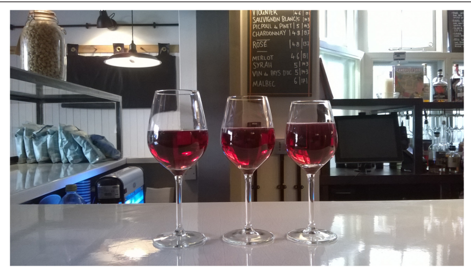
Fig. 1 Design of glasses used in the study (filled to 175 ml)

excluding wine were logged in the analyses. Due to heteroscedasticity, both the mean and variance of sales (see Table 2) were included in models (using identity and log links respectively).