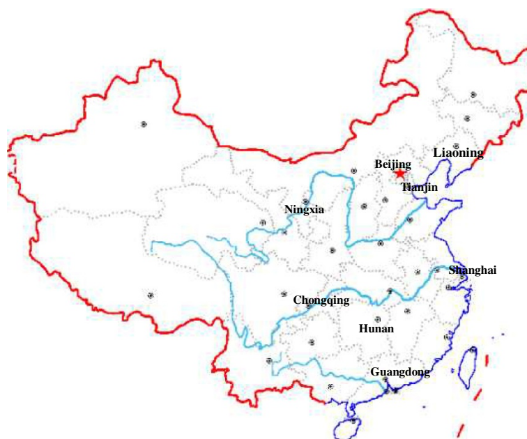
Figure 2 The geographic distribution of involved provinces and municipalities. This study was designed to be multi-center school-based cluster randomized controlled obesity intervention trial. Liaoning, Tianjin, Ningxia, Shanghai, Chongqing, Hunan, and Guangdong were involved in it.