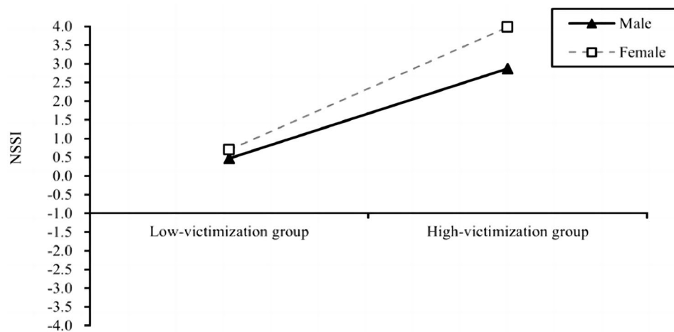
Fig. 2 Model of the test for simple slopes showing the moderating role of sex in the association between peer victimization and NSSI