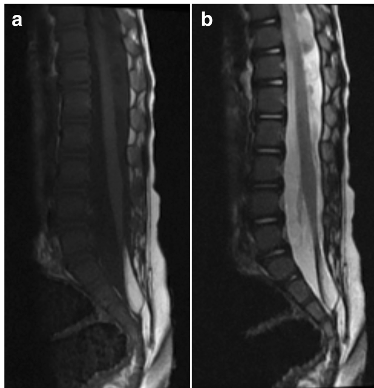
Fig. 1 a . T1 weighted MR images demonstrating low conus, fatty filum, and sacral intradural lipoma b . T2 weighted MR images demonstrating low conus, fatty filum, and sacral intradural lipoma

Kurotaki et al. reported the underlying genetic abnormality of the Sotos Syndrome as mutations of the NSD1 gene which acts as a co-repressor or a co-activator [6]. NSD1 includes two nuclear receptor-interacting domains (NIDs). These ligand-binding area perform on part of nuclear receptors which characteristics of both co-activators and co-repressors. The chromosome 5q35.2 gene on the NSD1 gene likewise plays a role in these two tasks. The NSD1 gene makes directives for making a protein that functions as a histone methyltransferase. Histones are structural proteins that bind to DNA (deoxyribonucleic acid) and Histone methyltransferases enzymes are modified. Members of the NSD family have a key role in controlling cell growth and differentiation for this subgroup of SET domain proteins which called nuclear receptor-binding proteins. The NSD1 enzyme controls the activity of normal growth and development of these genes. Abnormality in NSD1