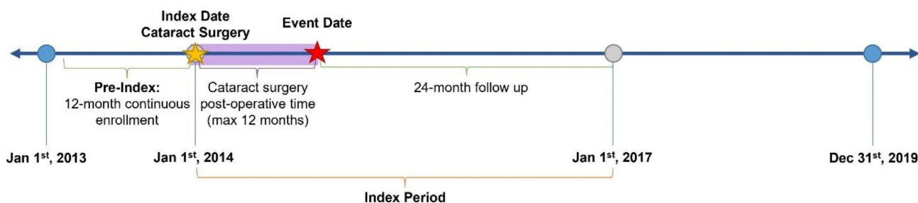
Fig. 1 Study design and timeline. This retrospective claims analysis identified adult patients from the IBM MarketScan Commercial and Medicare Supplemental databases who had cataract surgery between 2014 and 2017

Baseline characteristics were summarized for all variables using mean and standard deviation (SD) for continuous variables, and frequencies and proportions for categorical variables. Differences were assessed using Student's t -tests for continuous variables, and Chi-squared or Fischer's exact tests for categorical variables. Differences in the mean number and costs of eye-related outpatient visits, OCT scans, ophthalmic prescription medications, and injectable medication claims were assessed using multivariable linear regression models that adjusted for