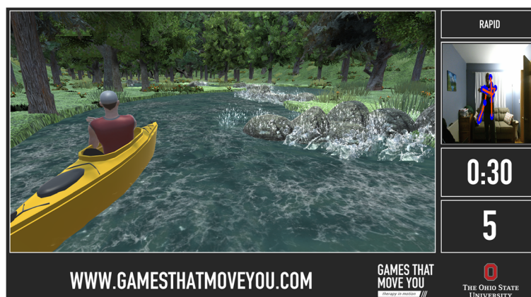
Fig. 1 Screen capture of the Recovery Rapids gaming environment

Smart watch biofeedback technology is utilized to promote use of the more affected upper extremity during daily activities in lieu of the mitt. The decision to replace the mitt with a PebbleTime™ smart watch app was informed by questionable importance of the mitt component of CI therapy [33, 34], poor compliance with mitt use in a previous pilot study (Borstad A, Crawfis R, Phillips K, Pax Lowes L, Worthen-Chaudhari L, Maung D, et al.: In-home delivery of constraint induced movement therapy via virtual reality gaming is safe and feasible: a pilot study, submitted), and expression of a strong preference for the app by the participants. The smart watch app uses a tri-axial accelerometer to record the number of movements made with the weaker arm. It provides approximate movement counts and alerts the user when a ten-minute period of inactivity is detected. The smart watch is worn on the less affected arm for 2 days prior to treatment initiation to establish a target