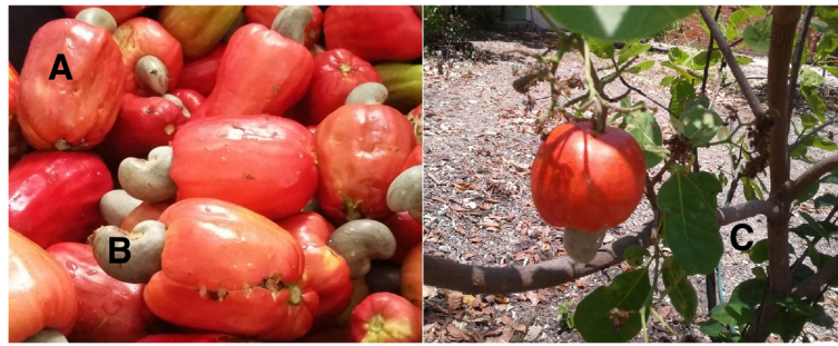
Fig. 1 Cashew. a Cashew pseudofruit; b ) Fruit (cashew nut); c ) Cashew tree. Images are the authors' own