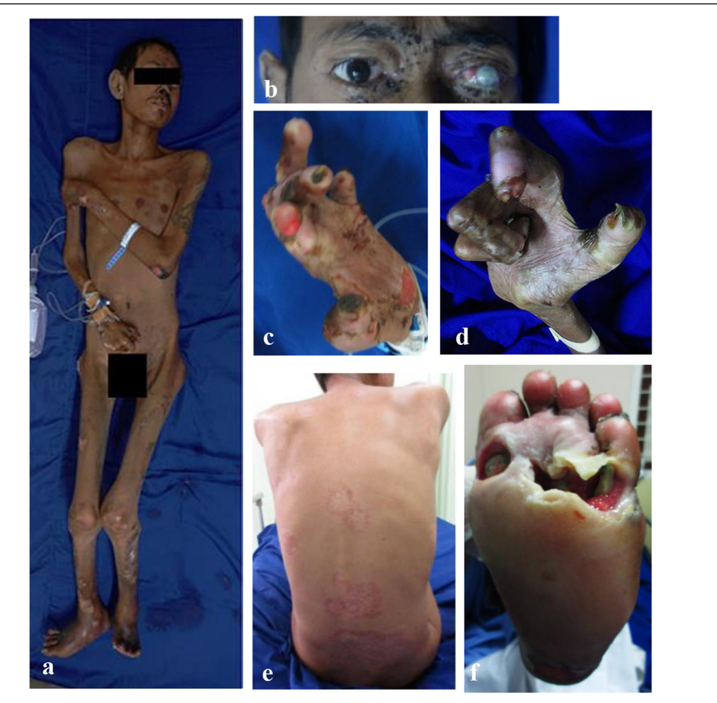
Fig. 1 Clinical manifestations of leprosy. (a) Hypopigmented macules, hyperpigmented macules and plaques (b) Lagophthalmos on the left eye and opacity of left cornea, (c-d) Claw hands and pseudomutilation, (e) Annular erythematous macules on the back, (f) Multiple ulcers on the foot

Gunawan et al. BMC Infectious Diseases (2021) 21:540 Page 3 of 5