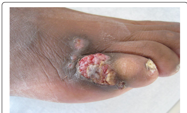
Fig. 1 Lesion due to Neoscytalidium dimidiatum in a kidney transplant recipient

The fifth patient was a 49-year-old male from the Republic of Congo. He was admitted to the hospital in May 2011 for multiple active cutaneous lesions. His medical history included a renal transplantation in February 2010 for a nephropathy of unknown origin. The