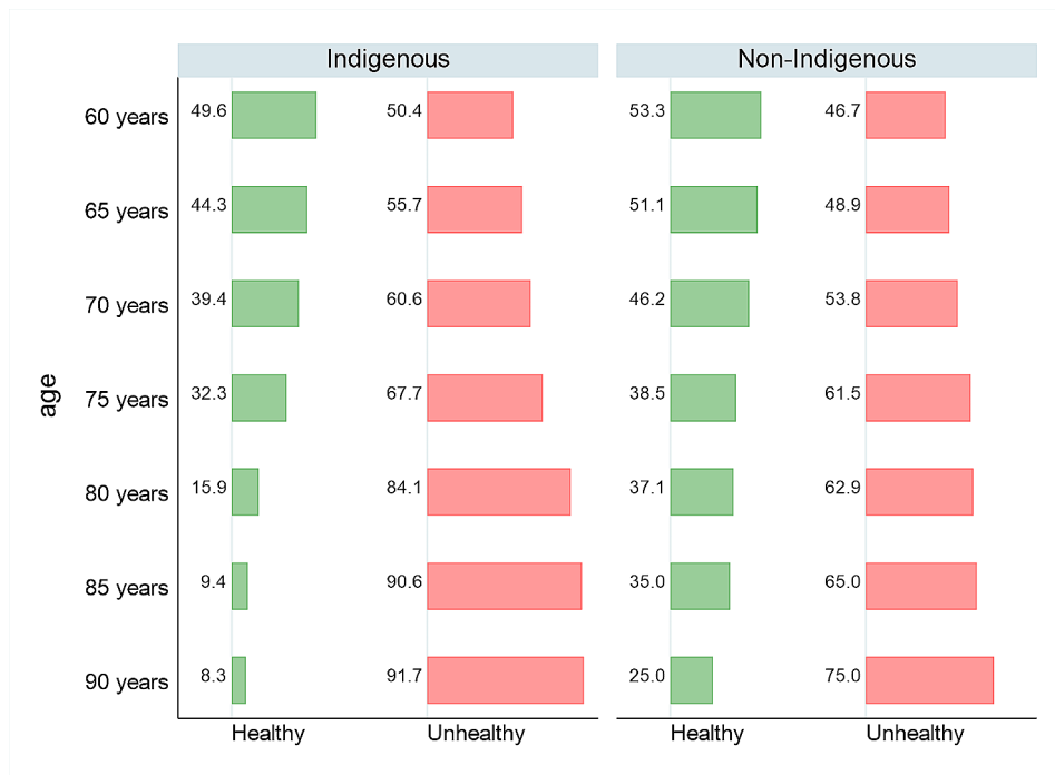
Fig. 2 Proportion of life spent disability-free (Healthy) and proportion with disability (Unhealthy) among Indigenous (Mapuche) and non-Indigenous older adults in Chile. Source: Own Elaboration using EDES Survey and Life Table by Ethnicity [31]

This study is in line with results in other countries that have shown ethnic-racial differences in longevity. This is the case of the United States of America (USA), a country in which ethnic-racial differentials in total, healthy (or disability-free) life expectancy has perhaps been studied in greater detail [56–58]. For example, Hayward and Heron [58] found that for adults (20–85 years) people of African descent live few years and they live a high proportion of those years with chronic health problems. Meanwhile, Solé-Auró et al. [57] analyzing disability-free life expectancy between 60 and 90 years of age according to gender, race, and educational level, detected that disability-free life expectancy only increased among white men, whereas life expectancy with disability increased