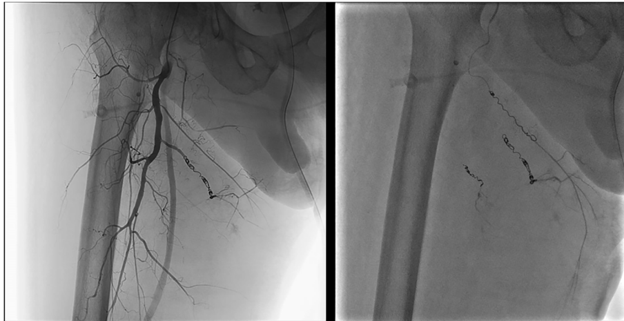
Fig. 2 Selective catheterism and coil embolization of hematoma's arterial afferences. The image shows the catheterized and embolized arterial afferences of Case 2's hematoma

shows the patient's routine blood test during the hospitalization. Although the procedure was successful and there was no evidence of further arterial extravasation, the patient died in the following days.