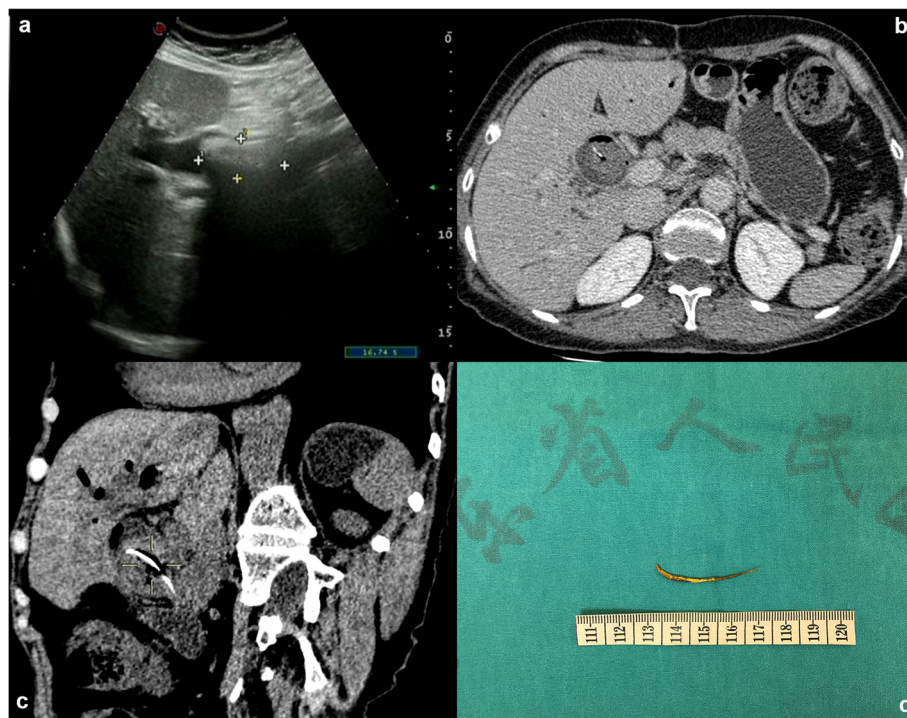
Fig. 1 Exploration and truth of the long high-density shadow. a Abdominal ultrasonography view of the biliary tract shows choledocholithiasis (4.4 cm \times 2.0 cm) with dilatation of intrahepatic and extrahepatic bile duct. b Plain CT scan image reveals a strip of hyperdense inside the CBD. c Coronal CT view of the long high-density shadow. d The photographs of the excised specimen showed a sharp linear fishbone

To prevent the patient from getting worse, we recommended ERC or PTC or surgery as a choice to the patient and her family. As the success ratio of ERC or PTC was decreased due to the large size of the choledocholithiasis and the surgery history, which increased the