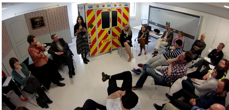
Fig. 1 An example of SqS

This SqS provided the focus for facilitated table discussions (facilitated by clinicians who took notes and guided the talks), which each included GP receptionists, patients and clinicians. The discussants suggested ways in which an unfortunate series of events could have been dealt with differently to improve the patient's journey. These suggestions were then incorporated in a repeat SqS. The events began and ended with talks about integrated care, and what it would mean for local GP practices. Representatives from the voluntary sector or local initiatives that may assist in more integrated care also gave short presentations.