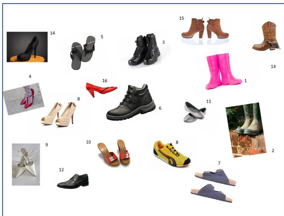
Figure 2 Representation of footwear character board to determine brand identity. If the study were footwear it would be a pink Wellington boot (readers can contact the authors for the original board used). Footnote for Figure 2: Copyrights for Figures. 1. Image by Phaitoon at FreeDigitalPhotos.net; 2. Image by Simon Howden at FreeDigitalPhotos.net; 3. Image by posterize at FreeDigitalPhotos.net; 4. Image by africa at FreeDigitalPhotos.net; 5. Image by John Kasawa at FreeDigitalPhotos.net; 6. Image by John Kasawa at FreeDigitalPhotos.net 7. Image by artur84 at FreeDigitalPhotos.net; 8. Image by bigjom at FreeDigitalPhotos.net; 9. Image by Sharron Goodyear at FreeDigitalPhotos.net; 11. Image by artur84 at FreeDigitalPhotos.net; 12. Image by John Kasawa at FreeDigitalPhotos.net; 13. Image by Boaz Yiftach at FreeDigitalPhotos.net; 14. Image by Gualberto107 at FreeDigitalPhotos.net; 15. Image by artur84 at FreeDigitalPhotos.net 16. Image by bigjom at FreeDigitalPhotos.net.

A recap of the results from STAGES 1–3 was given and young people worked in their groups to generate suitable names for the ‘2012 TYA Cancer Cohort Study’ taking