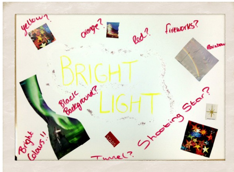
Figure 3 BRIGHTLIGHT mood board used for the logo design.

made. However, despite lower than anticipated recruitment so far the refusal rate to BRIGHTLIGHT is less than 20%, versus an anticipated 35% which was based on refusal/consent rates in other published TYA cancer studies [11-13].