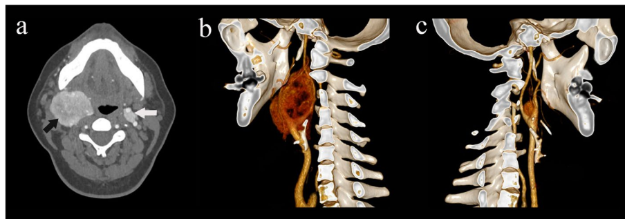
Fig. 2 Images of a patient with bilateral CBTs. a preoperative transverse CT scan. Black and white arrows indicate CBTs on the right and left sides. b, c Preoperative CT angiography scan from both sides

postoperative use of additional intravenous or oral anti-hypertensive agents, including \beta -blockers, aside from the preoperative medications, or the postoperative discontinuation of preoperative antihypertensive agents during hospitalization. Family history was defined as having an immediate family member diagnosed with paraganglioma. Plateau regions were defined as any plateau province at an average elevation of more than 1000 m above sea level in China, e.g., Qinghai Province, Guizhou Province, Tibet, Inner Mongolia, Xinjiang Uygur Autonomous Region, Ningxia Hui Autonomous Region, Yunnan Province or Gansu Province. Before surgery, patient presentation of cranial nerve palsy included cranial nerve symptoms, such as dysphonia, dysphagia, hoarseness or