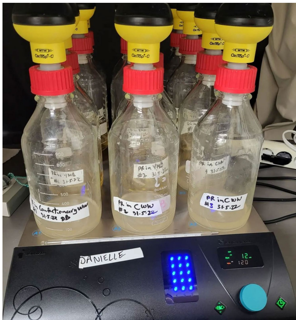
Fig. 1 Oxygen uptake measurements using the OxiTop system

Oxygen uptake was measured using a manometric respirometer (OxiTop Control 12 system, WTW, Xylem Analytics, Germany) (Fig. 1), as a non-invasive determinant of metabolic activity in the cells [23, 24]. Each species was grown in batch cultures for 1–2 weeks and their oxygen uptake was continuously (56 min intervals) measured. Experiments were set up using aseptic techniques as follows: 0.5 mL ( 0.5\text{ g DW (Dry Weight) L}^{-1} ) of culture