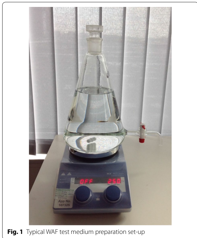
Fig. 1 Typical WAF test medium preparation set-up

As a result of this, in WAF tests the exposure expression is based on the nominal concentration used to prepare the WAF and not on any measure of the dissolved material that the test organisms are exposed to in the test system. This concept is of particular significance for UVCBs as the exposure expression represents the whole substance and not just the bioavailable fraction that is presented to the test organism.