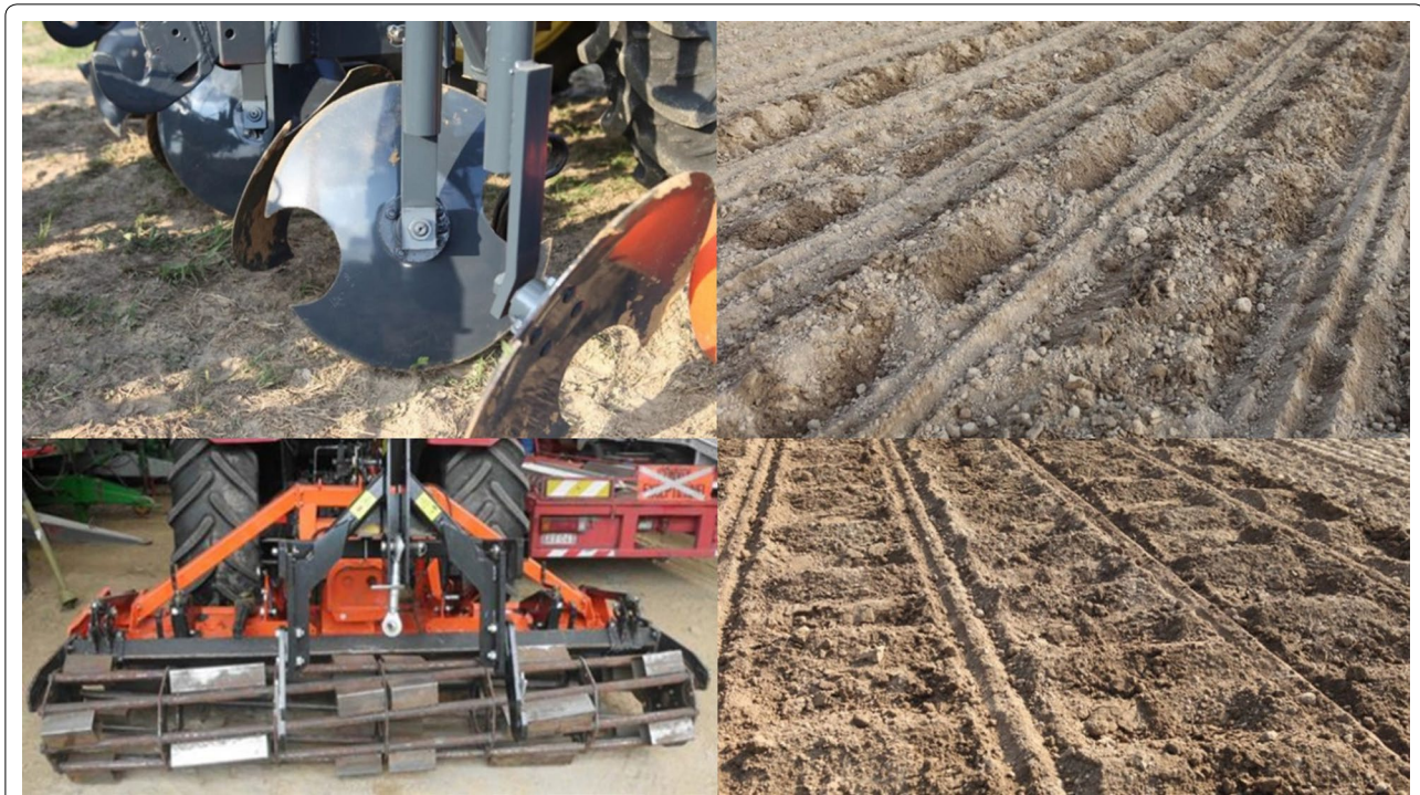
Fig. 2 Devices and resulting structures after usage in the cultivation of maize: upper row, disc plough; lower row, drum plough

in Olivier et al. [29], aclofen [10], linuron [20], flufenacet [30], and metribuzin [9] and in Goffart et al. [21], fluazinam [11], mancozeb [31], aclofen, flufenacet, and metribuzin were used. In the maize trials, flufenacet, isoxadifen-ethyl [32], tembotrione [13], terbutylazin [12] were applied in the CIPF [7] trial, and flufenacet in the UCL [41] trial.