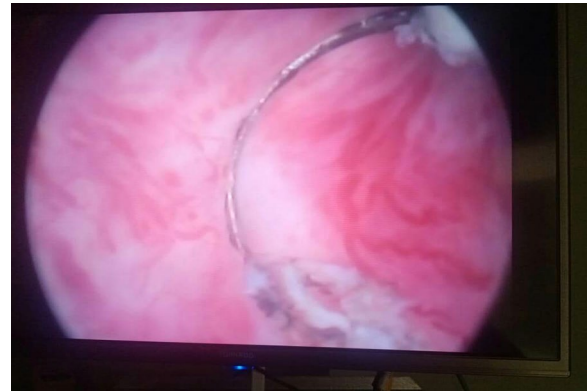
Fig. 3 Right lateral mucosal demarcation