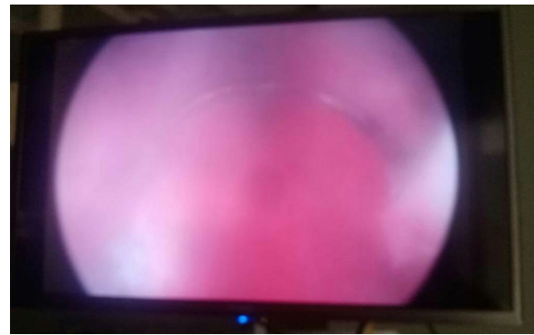
Fig. 4 Apical mucosal demarcation just proximal to verumontanum

the prostatic apex all around using a loop electrode was done.