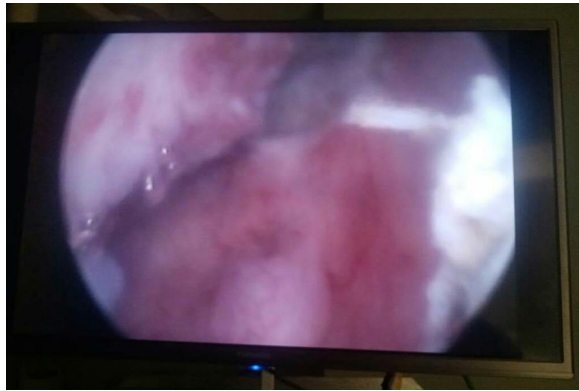
Fig. 1 Initial mucosal demarcation just proximal to verumontanum