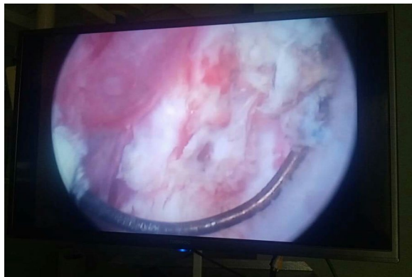
Fig. 2 Left lateral mucosal demarcation