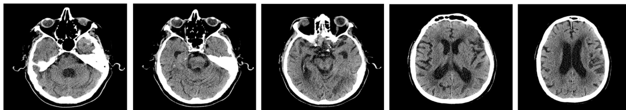
Fig. 2 Magnetic resonance imaging (MRI) of the brain

Another interesting observation was that our 6 of the 8 cases had hypernatremia, which was persistent in 4 cases lasting for more than at least 48 h. Our observation with hypernatremia has also been reported recently by other researchers [38]. They observed treatment-