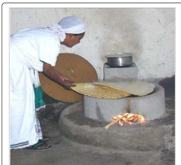
Fig. 1 Mirt improved cookstove technology. Source: The World Bank [39]

Once the eligible households were enrolled, a variety of strategies was used to avoid premature withdrawal of participants and the associated complexities in the analysis and interpretation of findings due to missing data. In this regard, active community engagement was established through the Ethiopian health extension program