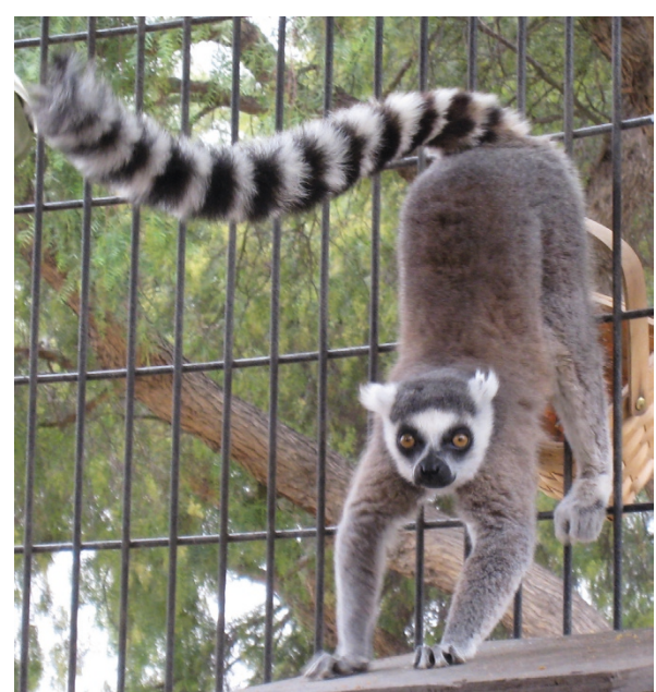
Figure 1. Ring-tailed Lemur ( Lemur catta ) using perianal glands for scent marking..

In work published recently in BMC Evolutionary Biology , Boulet and colleagues [1] have advanced this field by