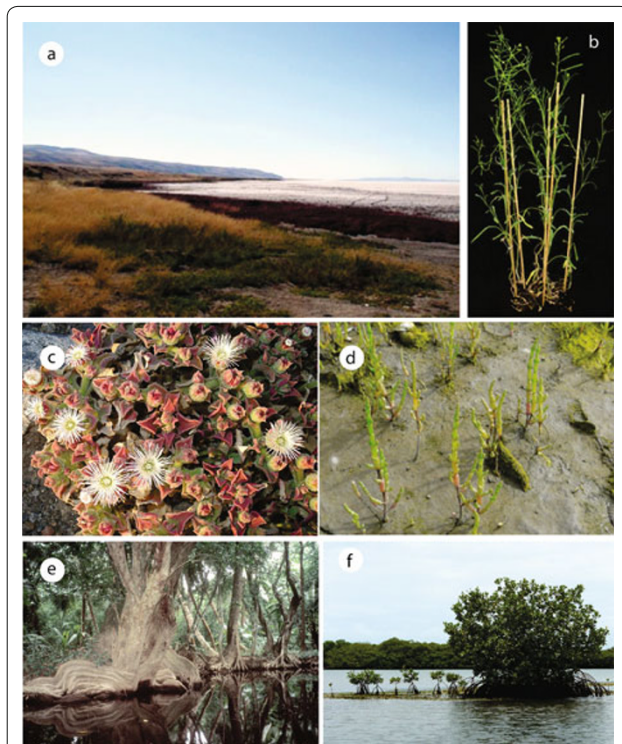
Figure 1. Some examples of extremophiles providing genome- or transcriptome-level data relevant to abiotic stress adaptation. These species are representative of those listed in Table 1. (a) The shores of Lake Tuz in central Anatolia (Turkey) were the original collection site for Thellungiella parvula (b) . Note the extensive salt flat where an ephemeral lake would be in a rainy season. (c) Mesembryanthemum crystallinum , known as the common ice plant for the salt crystals excreted from bladder cells on the leaves and stems. (d) Salicornia europaea (a relative of S. brachiata , Table 1) shown in the mud flats at Bull Island, Dublin, Ireland. (e) Heritiera littoralis , one of 27 species in North Queensland, Australia, shown growing along a creek with salinity varying between fresh water and ocean water. (f) Rhizophora mangle , shown as an ocean-fringing forest in the background and as substrate-stabilizing pioneers in the foreground.

closely related to it. One of these is the genome of Arabidopsis lyrata [19], a potential comparative model for drought tolerance [20], and T. parvula (Figure 1a,b) will be perhaps even more useful for elucidating a broad range of environmental adaptations [10]. This species and the congeneric T. salsuginea are endemic to regions that experience temperature extremes, poor, degraded, and toxic soils, and especially very high salinities [6,21]. The T. parvula genome is of particular interest because chromosomal assemblies that approach the coverage of A. thaliana are available. Moreover, because the Thellungiella species share many of the characteristics that led to the acceptance of Arabidopsis as a model (size, growth habit, seed amount, mutants, and transformation ability), they have been recognized as excellent candidates for comparative genomics studies [15,22].