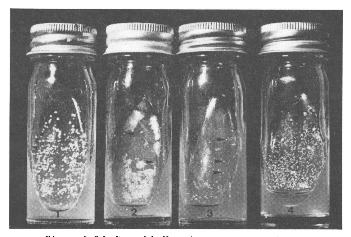
F i g u r e 2. Subcultures of the Norwegian goat pathogenic variant of Mycobacterium paratuberculosis on Dubos' medium after approx. 8 months' incubation at 37°C. Tubes 1 and 4 contain mycobactin, while tubes 2 and 3 do not. The arrows indicate individual colonies.

Subcultures were made onto Dubos' medium with and without mycobactin from 8 primary bacterial cultures, 1 tube with mycobactin and 2 tubes without for each culture. After 12 weeks of incubation there was dense growth in the culture tubes containing mycobactin while the tubes without mycobactin were negative. However, control readings taken about 5 months later revealed growth of small, white, irregular, dry colonies also in 6 cultures lacking mycobactin. One of the cultures produced growth in both of the tubes lacking mycobactin, while the remaining 5 produced growth in only 1. Fig. 2 shows secondary growth produced by subcultures after 35 weeks of incubation.