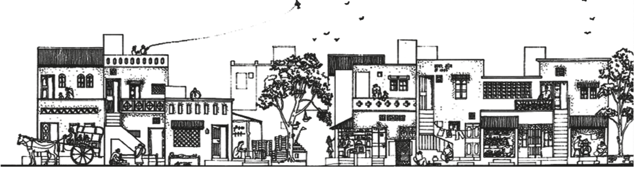
Figure 2 Envisaged Built form: Essentially a low rise high density development , the built form echoes the traditional fabric with continuity of built edge, shared walls, favourable micro climate, house form variations and culturally appropriate settings. Typical example of non-Western urban planning Aranya Community Housing, Indore, Madhya Pradesh. Architect: B.V. Doshi (Source: The Aga Khan Award for Architecture 1995).