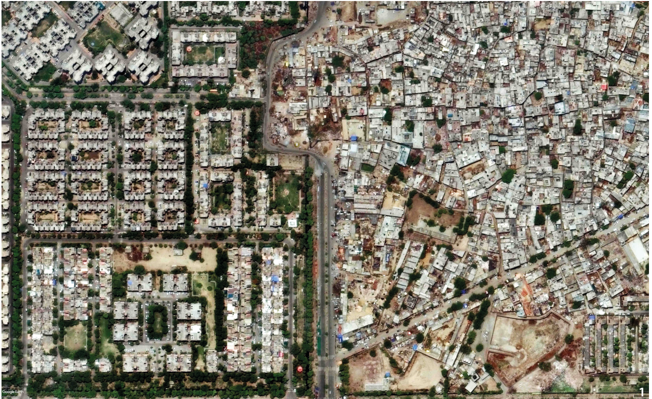
Figure 1 Aerial view of new developments near Delhi, showing informal settlements competing for space against the planned settlement. Such contestations are common in most Indian cities raising questions about appropriate strategies to adopt to cater the needs for rapid urbanisation.

people live and participate rather than by alien and unruly objects that must be tamed with the urban planner's objective expertise. Instead of perennially viewing what exists locally in negative terms and using Western standards as positive benchmarks, urban planners in India must understand that their inherited and supposedly neutral urban planning practices are driven by a logic of aggressive and purposive control of the population 9 . This new vision must be one that fosters social welfare rather than one which relies on punitive sanctions in single-minded service of the abstract patterns on paper which they call Master Plans. The current historical condition demands that the existing planning paradigm be cast aside; changing the way planners conceive the city is an important beginning in this process: the conferences I mentioned at the beginning were steps in that direction.