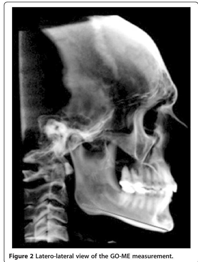
Figure 2 Latero-lateral view of the GO-ME measurement.

The 3D versus 3D comparison assessed by Student's t test where p < 0.05 was not proved to be statistically significant. The 2D versus 2D comparison was not proved to be statistically significant.