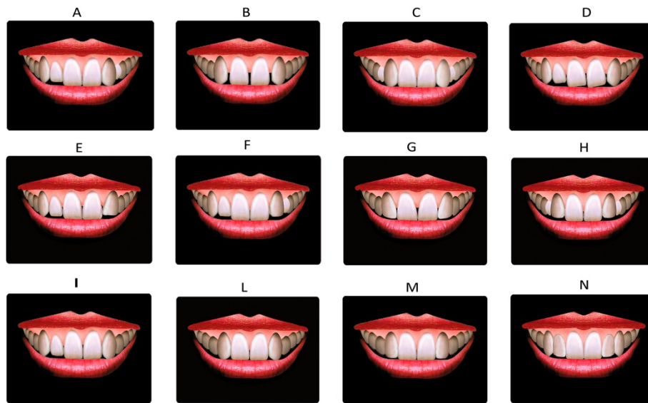
Figure 2 Simulations of different smiles and treatment options. Descriptions are found in the text.

All the simulations were collated on the second page of a two-page survey. Prints of the pictures were 2.4 \times 3.1 in. in size and were produced with the same inkjet printer on photo-quality glossy paper, using the 1,400-dpi print mode. Subjects (160) belonging to the four categories of people were selected for the interview: 40 laypeople (N), 40 adult orthodontic patients (P), 40 general dentists (D), and 40 orthodontists (S). Orthodontic patients were recruited at the dental clinic of the University of Insubria (Varese, Italy), while general dentists and orthodontists were recruited among former/current undergraduate/post-graduate students and associates of the dental school. Finally, laypeople were recruited among those accompanying relatives to the dental clinic who were not undergoing orthodontic treatments. The age of the whole sample ranged between 25 and 60 years old and showed a similar socioeconomic status. Ethical approval for this study was obtained from the local ethical committee of the University of Insubria (no. 5184), and informed consent was obtained from the involved subjects.