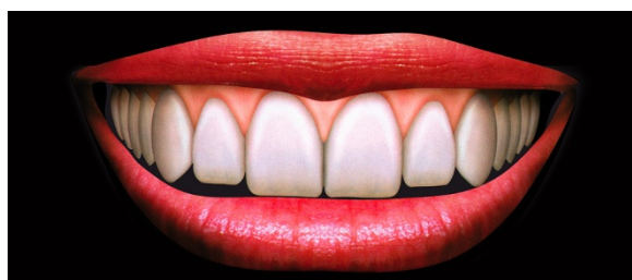
Figure 1 Ideal smile.

An ideal smile model was selected [17] (Figure 1) with the purpose of making a template digitally manipulated in all its components. The selected picture was edited using Adobe Photoshop CS3 software (Adobe Systems, San Jose, CA, USA). Graphic components were carried out from the picture of the ideal smile: upper lip, lower lip, gingival tissue, and teeth. Each component was editable in position, size, and shape in order to simulate different clinical situations and treatment options.