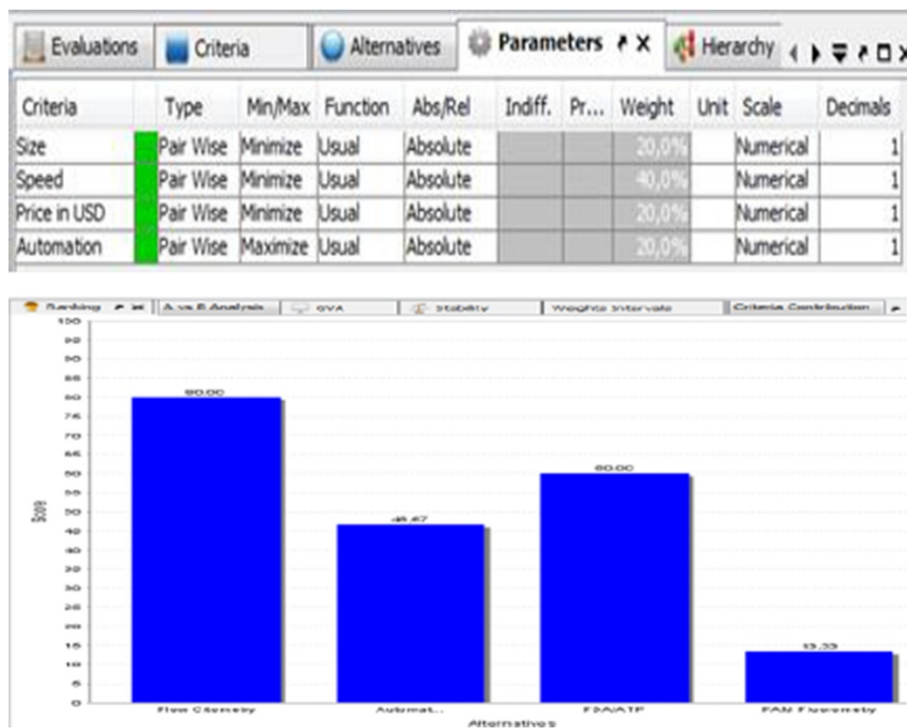
Figure 1 Multi-criteria analyses PROMETHEE II, visual D-Sight results.

D-Sight GAIA computerized visual method, as seen in the pictures, is also shown in the results of ranking as the most appropriate system. That is a visual projection of PROMETHEE analysis. Three parameters were used for detection criteria alternatives, currently the most researched. The most important parameter that determines the acceptability of the existing autonomy belongs exclusively to the flow cytometry, and that is why was not set as a criteria for multi-criteria analysis to achieve