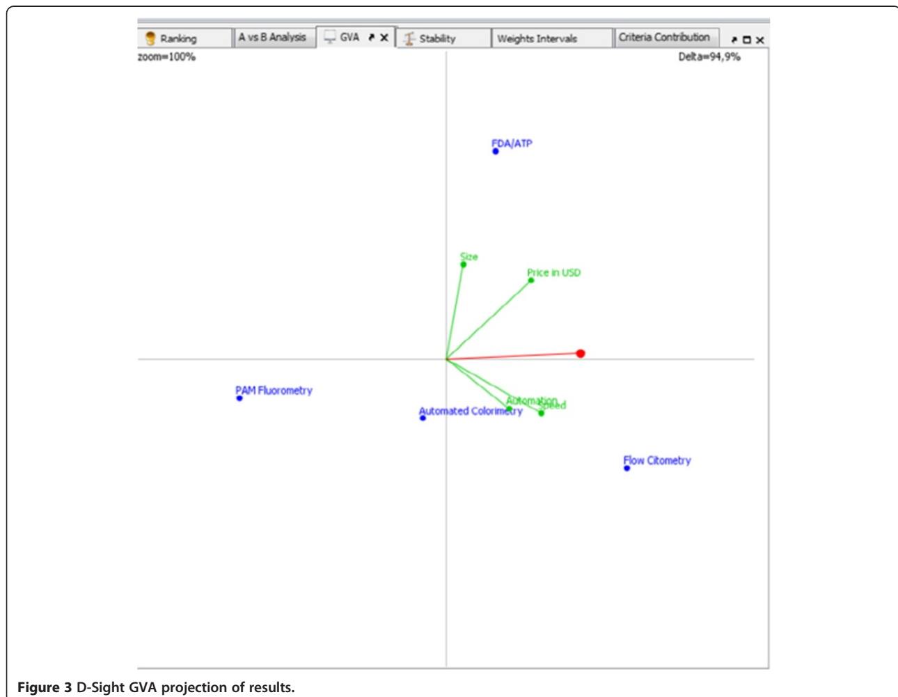
Figure 3 D-Sight GVA projection of results.

In the treated ballast water, after the treatment of most of neutralization systems, remains, beside to organisms \geq 10 and < 50 , a significant amount of organisms smaller than 10 microns. The results of research and detection by flow cytometry indicated that 80% of all existing phytoplankton in seawater are microorganisms smaller than 10 microns (Veldhuis and Kraay 2000). Required detection quality (indicative or compliance monitoring detection) from aspect of microorganisms size, speed of analyzes, period of analyzes and