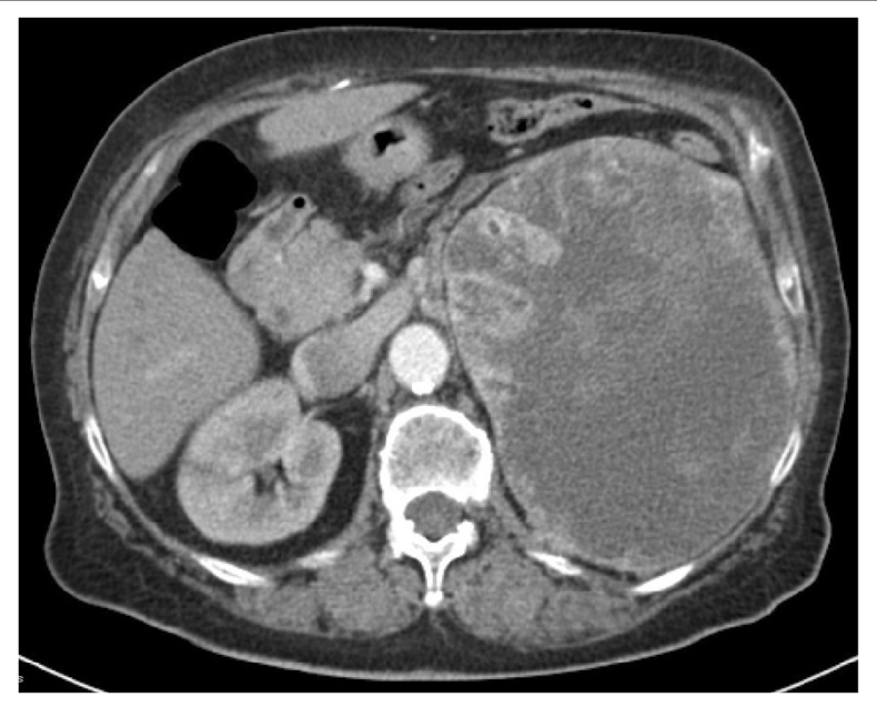
Figure 3 Postcontrast CT: woman 78-year-old, left kidney tumour T3aN0M1 (metastases to lung), maximal diameter of tumour 172 mm. In Table 2, case No. 9. She underwent cytoreductive nephrectomy, specimen 1850 g. Histology TRCC 6p21. She died in 3 months. The forth case of aggressive TRCC 6p21 described in literature.