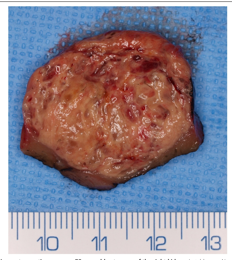
Figure 1 Dissected specimen at operation: woman, 75-year-old, a tumour of the right kidney. In table case No. 5. Tumour was on CT spheroid, 34 mm in maximal diameter, relatively homogenous, native density13-26HU, postcontrast density (venous phase) 15–43 HU. R was performed. A dissected specimen at operation: ochre-orange relatively homogenous spheroid tumour very different from clear renal cell carcinoma, maybe a little similar to any papillary RCC. Histological diagnosis: Translocation carcinoma Xp11.2, subtype ASPL-TFE3, verified genetically.

properties of this tumour, it has been termed "osette-like forming, HMB45-positive renal tumour" Hora et al. 2009. An alternative designation/term that is used is "TFEB RCC". This tumour harbours translocations involving the transcription factor EB (TFEB) and Alpha (the latter also known as MALATI). Genetically, TFEB RCC has been characterized by the fusion of the 5' portion of Alpha, also known as MALATI (Genbank accession number AF203815), an intronless gene mapped at 11q12, with TFEB at 6p21 Inamura et al. 2012; Rao et al. 2012. TFEB RCC is extremely rare, with fewer than 30 cases reported to date Hora et al. 2009; Inamura et al. 2012; Rao et al. 2012; Camparo et al. 2008; Suarez-Vilela et al. 2011. First 11 cases were reviewed by Hora et al. 2009, cases published since 2007 are summarised in Table 1. The morphology of TFEB TRCC is distinctive and the diagnosis can be established based on a combination of histopathological examination in conjunction with immunohistochemistry. Role of molecular genetic studies is not as crucial as in Xp11.2 TRCC Hora et al. 2009. The malignant potential is low. Only three cases