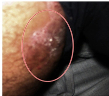
b. Tinea cruris