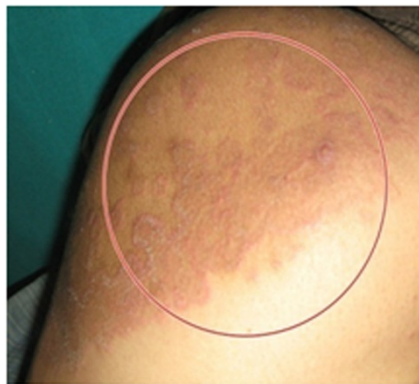
a. Tinea corporis

hyphae (pencil shaped, spiral, pyriform, septations etc.), microconidia and macroconidia (tear shaped, drop like, spherical, in bunches, abundance or rare etc.). Trichophyton rubrum (ATCC-28188), T. mentagrophyte (ATCC-18748) and Microsporum gypseum (ATCC-24102) obtained