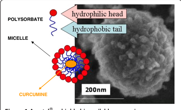
Figure 1 Arantal<sup>®</sup>, a highly bioavailable curcumin.

A Phase I pharmacokinetics study on Arantal<sup>®</sup>, a high bioavailable turmeric extract with a water solubility