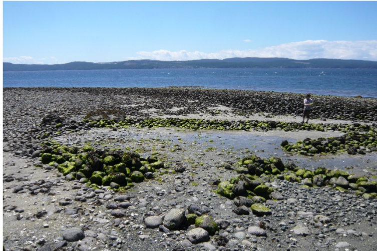
Figure 4 Hook-shaped stone intertidal fish trap near Powell River, B.C. that functioned by funneling and then trapping fish, such as herring and perch, in through the wall openings during a receding tide. Water held by the walls through the tidal sequence may have extended harvesting times.

to their spawning grounds further upriver (Langdon 2006b). Additionally, the Tlingit would rearrange rocks to improve stream flow and increase salmon spawning habitat; these same “streamscaping” actions would also improve visibility for salmon gaffing (Langdon 2006b). Notably, none of these behaviors will be detectable in the archaeological record.