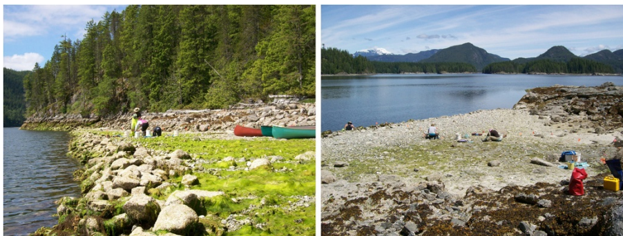
Figure 6 Clam gardens on Quadra Island, B.C. The garden is composed of a rock wall placed at the zero tide line (see wall foreground of left image, and left side of right image), which creates a flat expanse of clam habitat at an ideal tidal height. In these photos, marine ecologist Amy Groesbeck and crew are sampling clams to understand how clam garden modifications affect clam growth and development.

On the Northwest Coast, as elsewhere, traditional tenure systems are fundamental to sustained marine resource management (e.g., Johannes 1981, 1982; Haggan et al. 2006; Turner and Jones 2000; Turner 2005). Such systems of ownership were embedded in larger hereditary kin- and status-based social networks (e.g., Powell 2012; Turner et al. 2000; Turner 2005) and regulated the timing and amount of resources extracted. Tenure associated with marine resources was asserted through the ownership of fish harvesting locations (e.g. streams, dip netting rocks, fish traps/weirs, coves), the rights to catch fish from specific locations (Turner and Jones 2000),