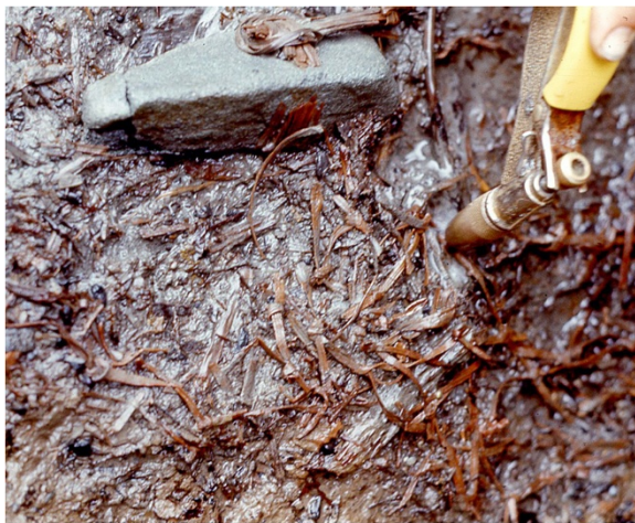
Figure 3 Remains of an approximately 2,800-year-old gill net recovered from the Hoko River site (45CA213) in Washington. The net is made of mono-filament Sitka spruce limb splints and tied with non-slip square knots placed approximately 5 cm apart. The net was recovered with an attached anchor stone, indicating that it was likely used for fishing (Croes 1995). Prior to its recovery, Washington State Fish and Wildlife Department lawyers argued in American Indian fishing rights court that Europeans introduced net fishing to the Northwest Coast. (Photo: courtesy of Dale Croes).

sometimes provide information on the harvest of taxa that are rarely preserved in archaeological contexts (e.g., Pacific octopus [ Enteroctopus dofleini ] and sea cucumbers [ Parastichopus californicus ]).