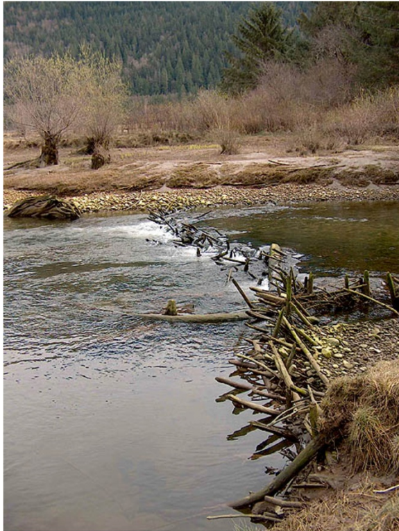
Figure 2 Approximately 200-year-old wooden riverine fish weir in South Bentick Arm, Central Coast, B.C. This was likely used to trap salmon by impeding their movement upstream.