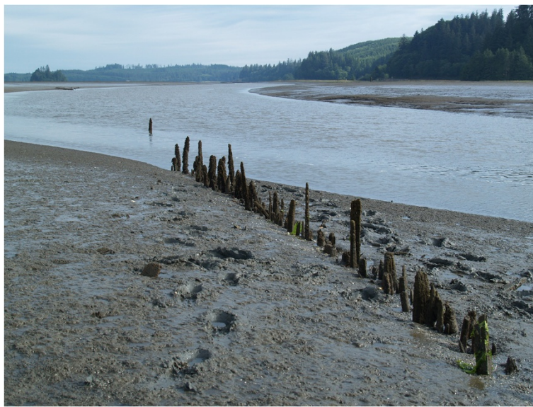
Figure 5 Wooden intertidal fish weir at Bear River, Willapa Bay, Washington. In a functional weir, stakes would run across the river channel. The absence of stakes in the channel in this feature suggests that the trap was dismantled some time in the past. Note footprints next to stakes for scale.

to the ecological benefits of aerating the beach sediments while harvesting clams, people harvesting clams recognize the benefits of returning broken shells and gravels to the beach to keep the sediments productive (Nathan Cardinal and Nicole Smith, pers. comm. to M. Caldwell). Measurements of archaeological clam shells suggest that in some cases only clams of a certain size (age) were collected and that it is possible that clam beds were left fallow to allow populations to reach the harvestable size (Cannon and Burchell 2009). This