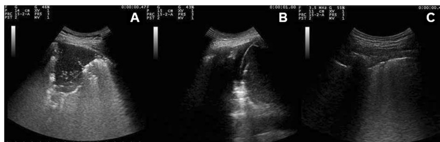
Figure 1 Chest ultrasonographic patterns: lung consolidation (A), pleural effusion (B) and sonographic interstitial syndrome (C).

As already reported in literature, the use of radiation for diagnostic imaging in pregnant women is associated