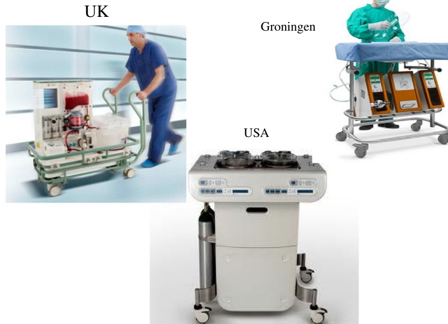
Figure 2 Machine preservation systems used worldwide. The perfusion preservation machine in the UK is applicable for both cold and normothermic conditions (left). The machine developed in the USA is for cold preservation (bottom).

donor is evaluated and consent for organ donation is obtained. In addition, using NECMO to maintain organs offers the theoretical benefit of applying cytoprotective substances that can support functional recovery.