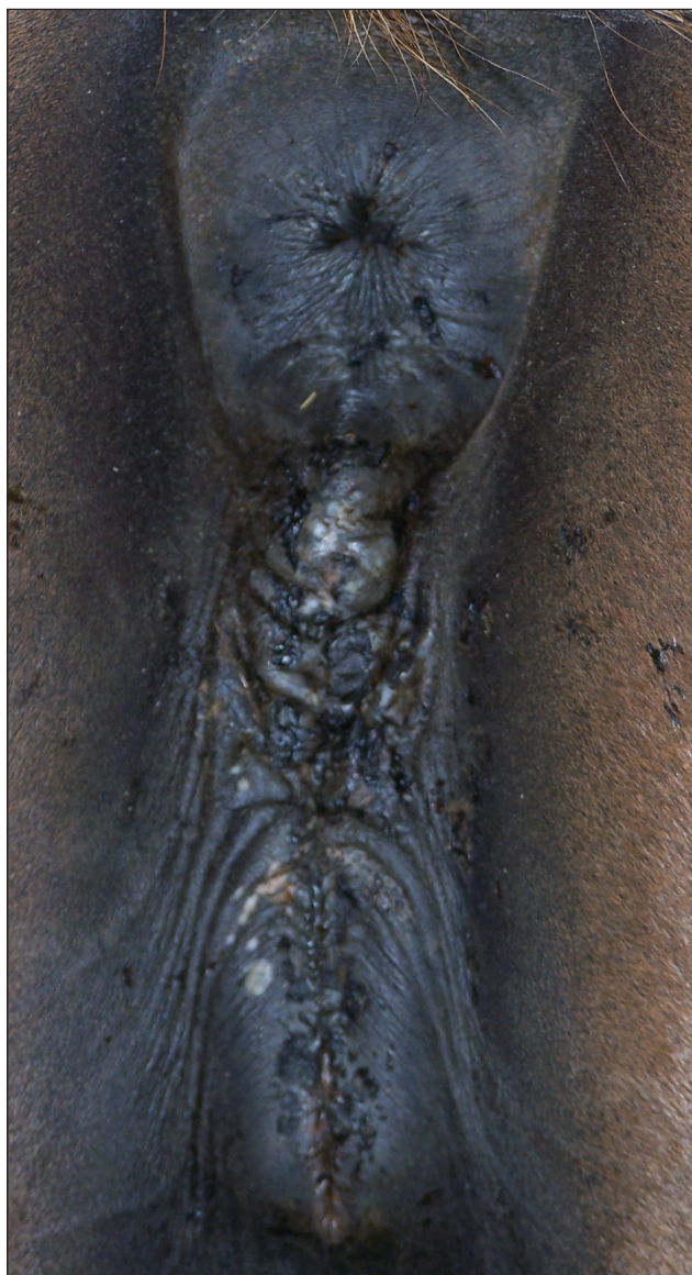
Figure 1b: Altered conformation of the vulva. The labiae do not create a proper seal and the rectum is displaced cranially, allowing the vulva to be pulled dorsal to the ischiatic arch, causing constant faecal contamination of the vulva and vestibule.

per second and help to transport mucus, fluid, bacteria and other debris along the longitudinal folds of the endometrium and the cervix (Causey, 2007). However, dilated capillary spaces between the folds and damaged, scarred or atrophic folds disturb this precise clearance mechanism (Causey, 2007). Ulceration, degeneration and lack of cilia are suggested to have the same effect (Causey, 2007).