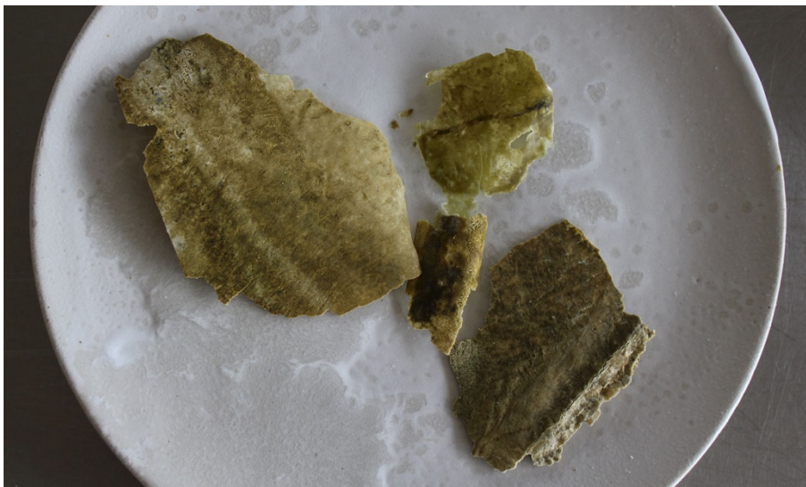
Figure 4 Kelp ‘crisps’ that are formed as flakes when dehydrating a dashi produced by extraction of rausu-konbu ..

Turning to the dashi prepared from sugar kelp, Table 1 shows that dashi from sugar kelp contains very little of any of the free amino acids analysed, and the results did not depend on whether we used extraction temperatures of 60°C or 100°C. Additionally, the measured amounts are so low that we can find no discernible dependence on