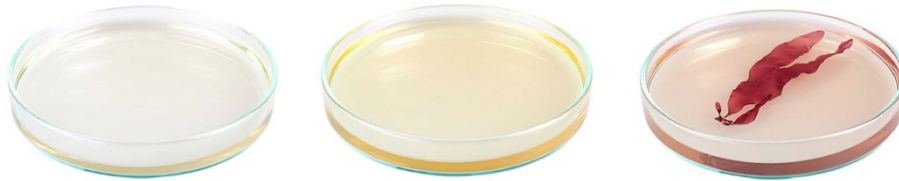
Figure 3 Dashi based on three different seaweed extracts. Left: Konbu dashi from Saccharina japonica . Middle: Traditional Japanese ichiban-dashi from konbu and katsuo-bushi . Right: Nordic dashi from dulse ( Palmaria palmata ). For illustration, a piece of dulse is left in the dulse dashi . (Photography: Jonas Drotner Mouritsen.).

The different dashi preparations made from the different samples of dried seaweeds were analysed for their full amino acid content and profile, with a focus on glutamate and aspartate, which provide umami flavour, and alaninate, which provides a sweet flavour. The results are shown in Table 1. Figure 5 shows the full amino acid profiles for two types of dashi made from rausu-konbu and dulse, respectively. We shall return to a discussion of these profiles in the ‘Discussion’ section below and to a comparison of dashi made from different seaweeds as opposed to the use of different extraction techniques.