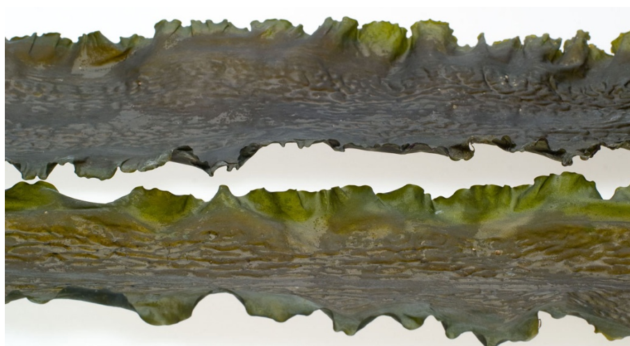
Figure 1 Dried sugar kelp ( Saccharina latissima ) farmed in Horsens, Denmark.

This red and stringy seaweed, also called 'sea moss' because of its thread-thin fronds, has not been used to date in Western cuisine. It is traditionally used as a sea vegetable, for example, in Hawaii and Japan, where it is called ogonori . Gracilaria is a rich source of agar that is used as a thickening agent. In recent years, it has made its way into the Nordic waters, where it is considered one of the invasive species that threatens domestic marine life. In the present work, we used Gracilaria farmed in Denmark, and all samples were dried before use.