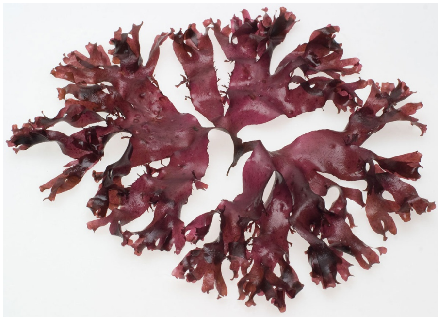
Figure 2 Dried dulse ( Palmaria palmata ) farmed in Horsens, Denmark. (Photography: Jonas Drotner Mouritsen).