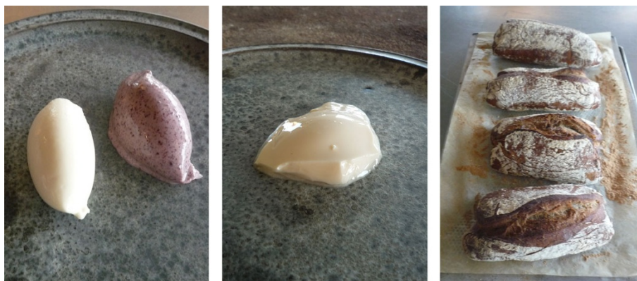
Figure 6 Examples of dishes flavoured with dulse. Left: Ice cream without and with dulse infusion. Middle: Fresh cheese infused with dulse. Right: Bread made from a sourdough infused with dulse.

Whisk dashi , starter, yeast and salt together. Add flour and mix at low speed for 5 minutes. Incorporate the minced dulse. Oil a suitable vessel, and proof in a 5°C