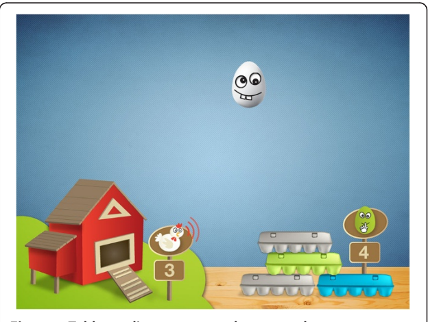
Figure 1 Tablet audiometer gameplay screenshot.

Study participants were recruited from patients presenting to the Audiology Clinic at the Children's Hospital of