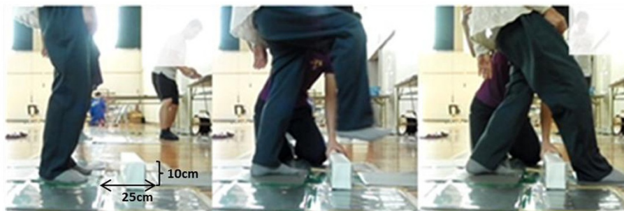
Participants stepped forward while stepping over an obstacle (OSFS-F),

The returning phase time was considered to be the time from the moment the leg is raised off the forward step sheet until it is placed back on the