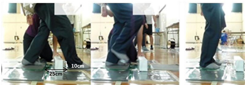
and returned to original place while stepping over an obstacle (OSFS-R).