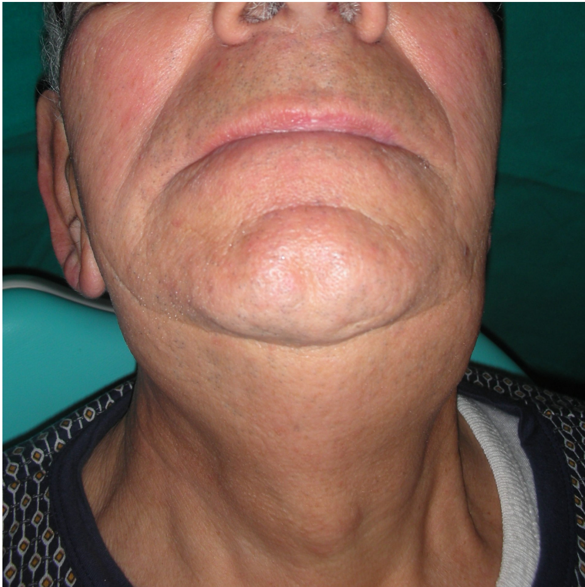
Figure 1 Hard tumefaction of a normal color in the left submandibular region.

lumen; after the worsening of breathing, other colleagues performed an emergency inferior tracheostomy and provided medical advice.