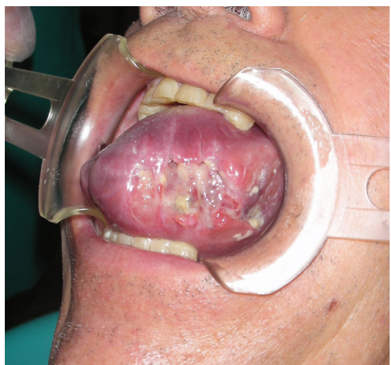
Figure 3 Considerable volumetric increase of the tongue.

and symptoms, and a frequent and dangerous resemblance to benign orodental conditions. Obviously, these features are potentially responsible for an incorrect or late diagnosis and an underestimation of the pathology, thus drastically worsening the prognosis.