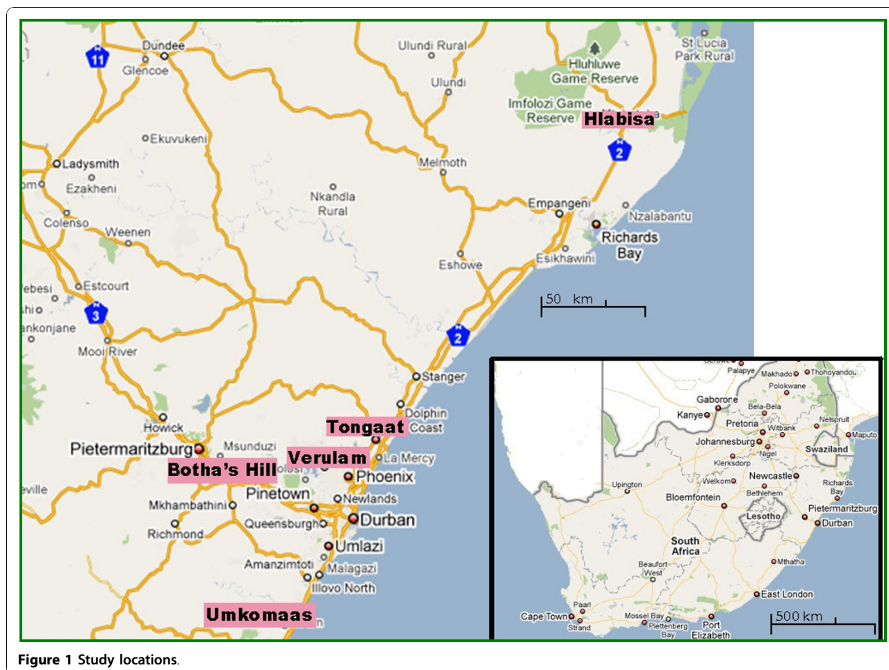
Figure 1 Study locations.

Analysis identified three hotspots or clusters of prevalence, and these included 458 cases (19% of all) recruited at two study sites: a less urbanized clinic in Botha's Hill and a peri-urban clinic in Umkomaas. These three hotspots were determined to be areas of particularly high prevalence when compared with other study sites (Verulam, Tongaat, Hlabisa and Durban) (Figure 2).