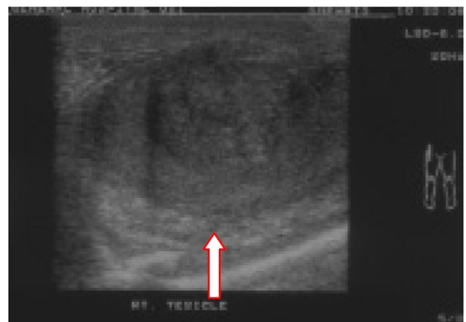
Figure 2 Ultrasound right testis demonstrating loss of tissue plane between testis and adjacent structures/overlying skin (arrow).

cutaneous metastases at other sites have been reported including the extremities, genitalia, head and neck [6,7]. Several mechanisms of cutaneous metastases have been postulated including haematogenous spread, lymphatic spread, direct extension, spread along ligaments of embryonic origin and seeding of exfoliated tumour cells. Tumour cell seeding or implantation is thought to be the most likely pathogenesis where there is metastasis to incisions made at laparoscopic or open colectomy for colorectal cancer resection. We postulate that the propensity for incisional metastasis results from changes in the local cellular environment, for example altered lymphatic drainage or increased propensity for tumour cell deposition secondary to modified adhesion molecule profile or