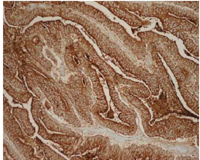
Figure 5 Demonstrates tumour tissue staining strongly positive for CK-20, magnification \times 400 .