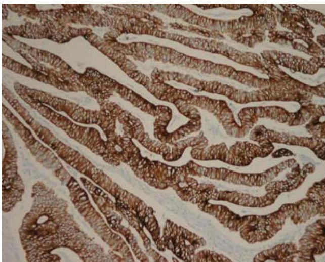
Figure 4 Demonstrates tumour tissue staining strongly positive for CEA, magnification \times 400 .

Written informed consent was obtained from the patient's next or kin for publication of this case report and accompanying images. A copy of the written consent is available for review by the Editor-in-Chief of this journal.