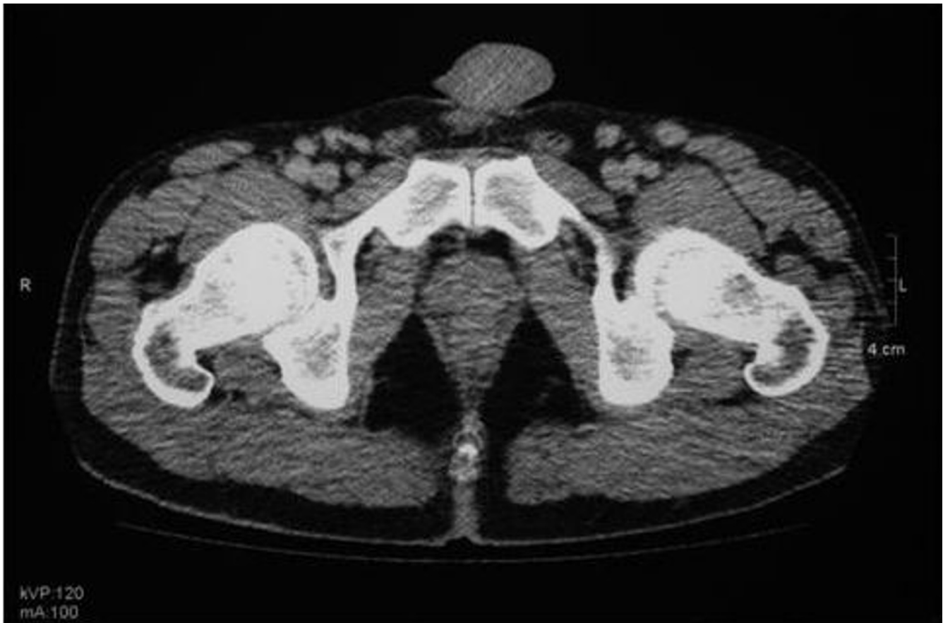
Figure 2 CT scan of pelvis indicating multiple enlarged lymph nodes.

borrelia burgdoderi, brucella abortus, chlamydia, Q fever, mycoplasma, and HHV8 were negative. ASOT was < 200. Urine cultures for mycobacterium were repeatedly negative.