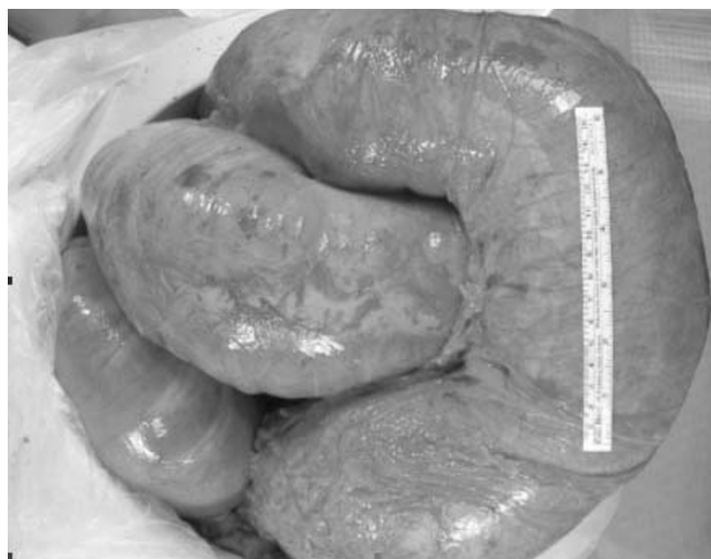
Figure 3 Gross specimen post-colectomy.