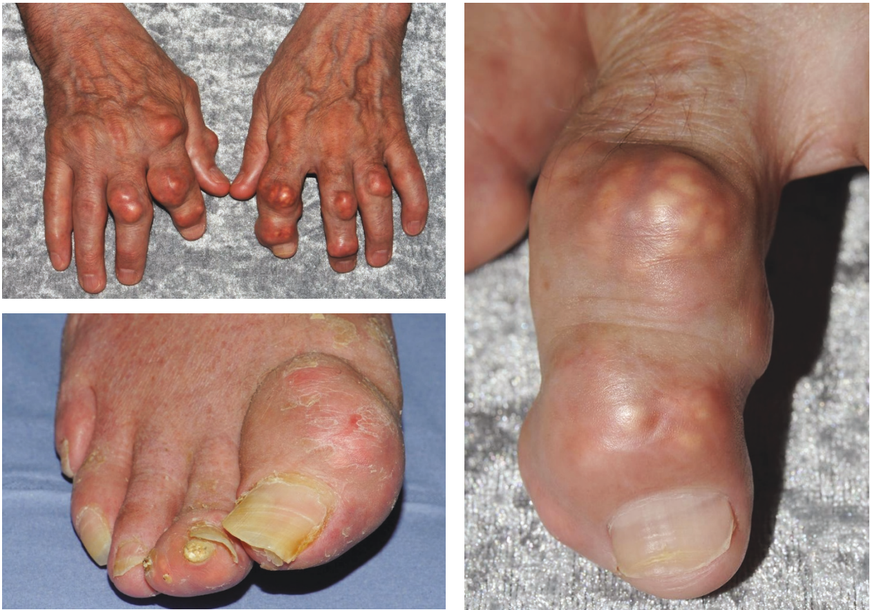
Figure 2 Tophaceous gout affecting the right great toe and finger interphalangeal joints. Note the asymmetrical swelling and yellow-white discoloration.

hyperuricaemia and subsequently MSU crystal formation occurs [16,17]. Crystals are then shed into the joint and activate the inflammatory cascade via the NALP3 inflammasome [18,19]. Hence, any explanation of why gout targets the foot must link these pathological processes to the specific anatomical, functional, and disease characteristics of the foot (Figure 3).