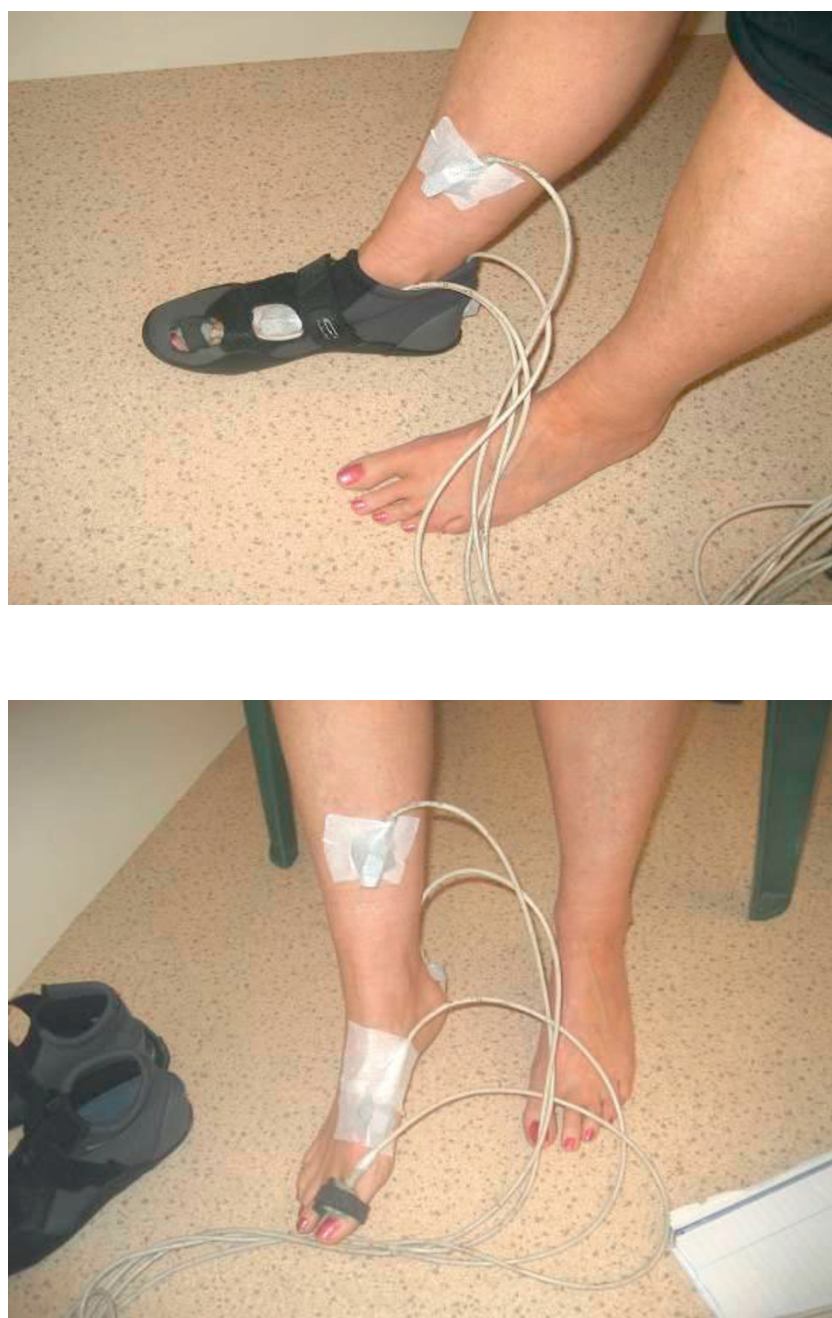
Figure 2 2a. Sensor placement. 2b. With neoprene boot. This shows the position of the EMT sensors attached at the anatomical landmarks and with the Velcro fastening, neoprene boot secured, which was used during the capture of kinematic data.