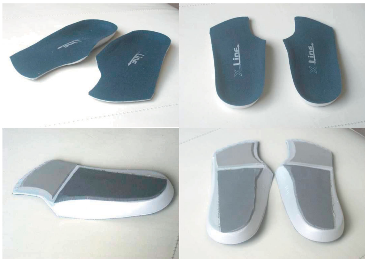
Figure 1 Type of foot orthoses used in the study. This shows the pre-fabricated foot orthoses that were used in the study, following individually tailored modification.

the patient's specific needs reflects a more realistic therapeutic approach than the use of artificially standardised prescriptions.