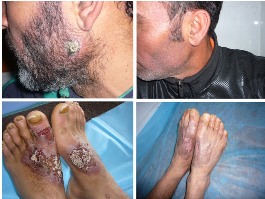
Figure 1 Painless crusted nodule over left cheek at angle of mandible and bilateral asymmetrical large well-defined erythematous ulcerated plaques with crusts over dorsa of feet (left images). Complete healing after two months treatment by Rifampicin and Isoniazide (right images).

with acute contact dermatitis with secondary bacterial infection. However, a 2 mm punch biopsy and slit-skin smear was obtained from all lesions. Smears were fixed and stained with Giemsa's stain. Leishmania parasites were heavily seen inside and outside infected macrophages (Figure 2). Molecular identifications of the causative Leishmania species by amplifying the internal transcribed spacer1 (ITS1-PCR) [1] failed due to PCR inhibition problems. After parenteral administration of sodium stiboglyconate (Pentostam) (20 mg/kg/day) for 28 days the lesions did not show any marked improvement, and skin-slit smears were positive for Leishmania