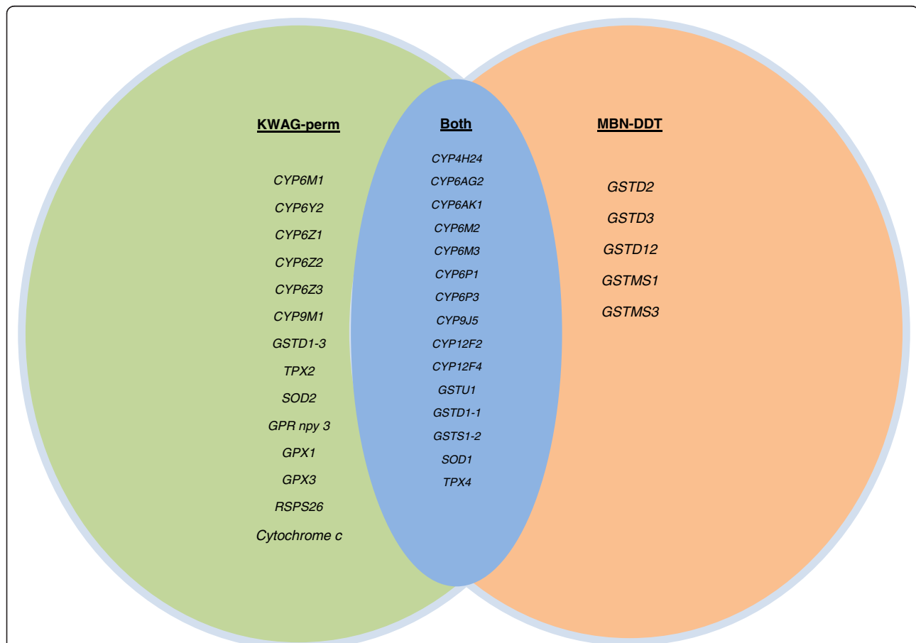
Figure 3 The list of over-transcribed probes obtained in the present study was compared with that obtained in the previous study of Nardini et al. [8]. Fifteen genes were over-transcribed in both strains. However, 14 genes were unique in the KWAG-perm strain and were not over-transcribed in the deltamethrin-resistant strain. Five of the over-transcribed genes were unique to the deltamethrin strain and all of these were GSTs.