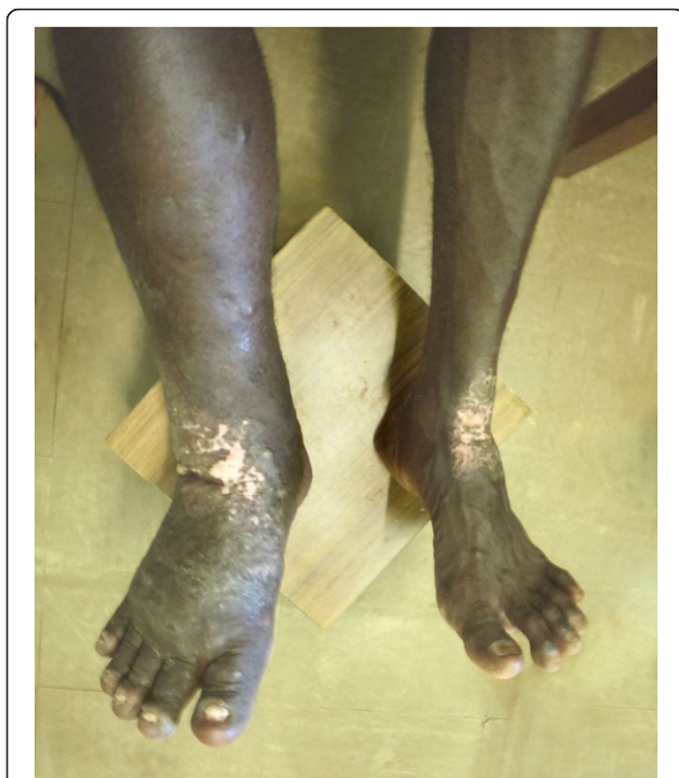
Figure 2 Both legs (anterior). Male 44 years from Alasi, Malaita, Solomon Islands with swelling of right lower leg of 16 months duration. Vitiligo is present on flexor aspects of both ankles and had appeared before the limb swelling.

Although Solomon Islands had been an LF endemic country in the past, in 2011 it was considered to be free of lymphatic filariasis. The case of recent elephantiasis therefore raised the possibility that transmission of LF