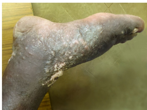
Figure 4 Skin lesions foot. Nodular epidermal changes associated with elephantiasis of right leg (medial view).

may still be occurring in this remote area. Prior to April 2011 the patient had been seen purely as a clinical case and the public health implications had been ignored. However, once the local health professionals were made aware of the programmatic significance of the case, they were adamant that the index case's community be investigated for active transmission of W. bancrofti .