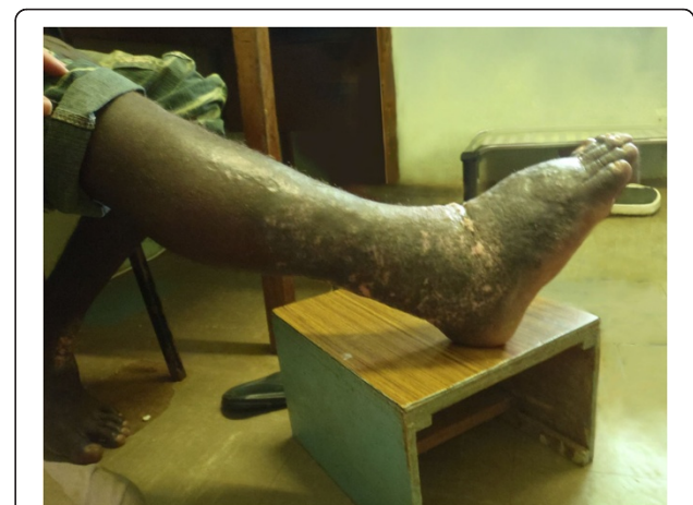
Figure 3 Right leg (lateral). Elephantiasis of right leg of 44 year old male from Alasi, Malaita, Solomon Islands (lateral view).