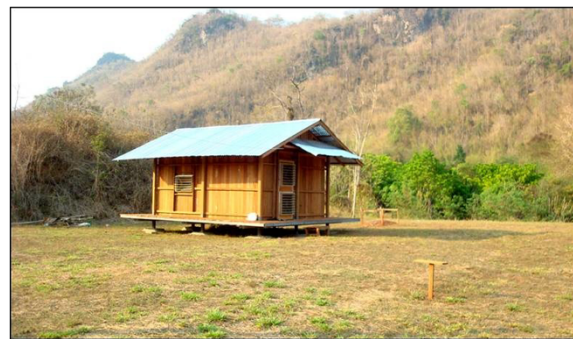
Figure 1 Experimental huts. Evaluations were conducted using experimental huts in Pu Teuy Village Thailand.

Technical grade DDT –1,1 Bis (4-chlorophenyl)-2,2,2- trichloroethane, (CAS 50-29-3, Sigma-Aldrich) and metofluthrin coils (0.00625%; SC Johnson & Co.) were evaluated in separate experiments. These chemicals were selected based on current World Health Organization Pesticide Evaluation